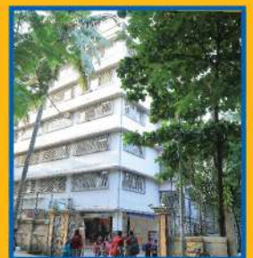
Veer Bhagat Singh International School Malad (West)