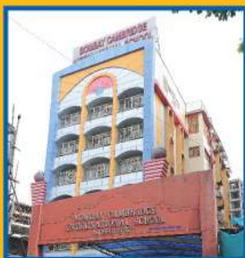
Bombay Cambridge International School Andheri (West)

73044 77054 / 93218 31191 admissions@bcseast.org www.bcseast.org