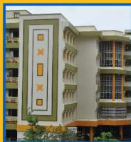
Dr. S. Radhakrishnan International School Malad (West)