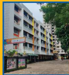
Dr. S. Radhakrishnan International School Borivali (West)