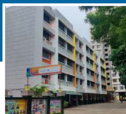
Dr. S. Radhakrishnan International School Borivali (West)