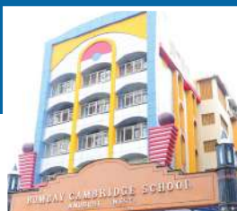
Bombay Cambridge International School Andheri (West)