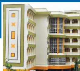
Dr. S. Radhakrishnan International School Malad (West)