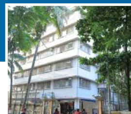
Veer Bhagat Singh International School Malad (West)