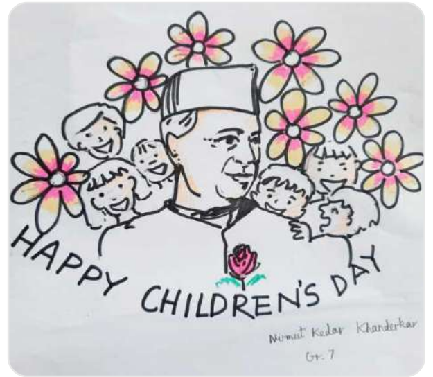
Submitted by Nirmeet Khandekar Class 7