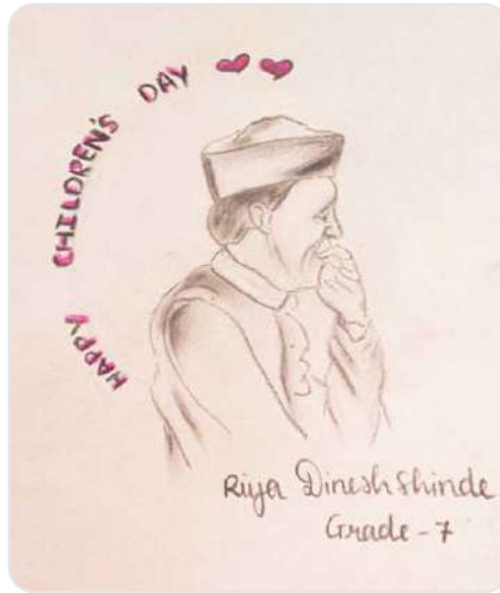
Submitted by Riya Shinde Class 7