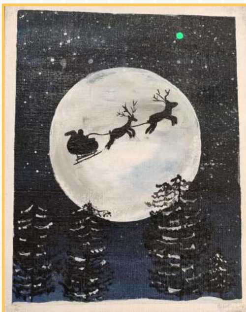
Submitted by Shiza Siddiqui Grade 6, BCISE